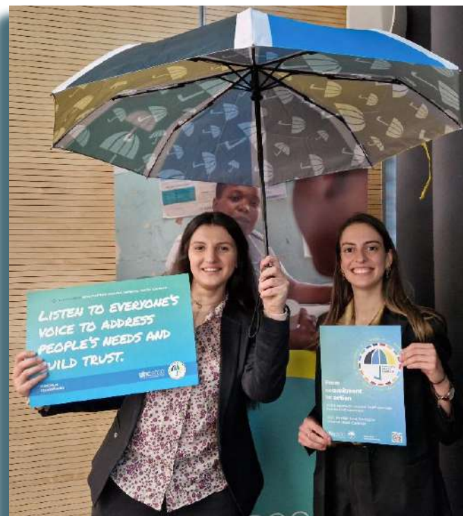
World Health Assembly, 21–30 May 2023

In its commitment to strengthening participatory governance in health, CSEM co-organized events on social participation with the WHO, collaborated with partners like the SPHERE Project to support country partners, and created advocacy tools to support engagement and knowledge-sharing on institutionalizing social participation for health. In addition, the platform organized civil society partners around the world to commemorate UHC Day on December 12 through a comprehensive global communications and advocacy campaign.