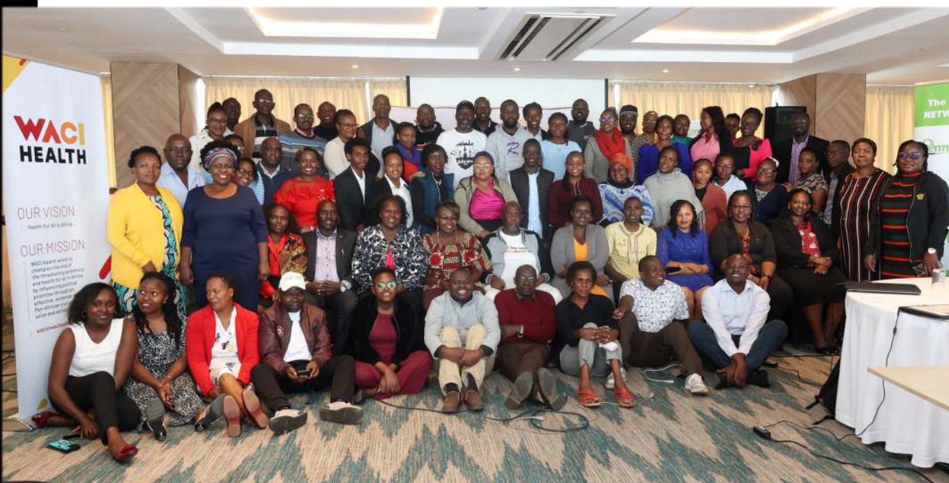
Kenya Country National Dialogue on Health Financing, 26–27 April 2023

Through concerted efforts and strong engagement, civil society input was included in national health financing reforms . Partners included HENNET, NEPHAK, KANCO, the Stop TB Partnership, and the Key Population Consortium of Kenya.