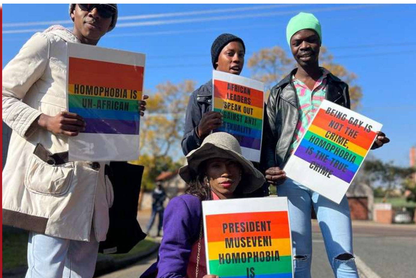
Africa Regional Day of Action, 26 July 2023

GFAN Africa and AfNHi continue to provide a critical safe space for communities, civil society, and activists to reflect on a harsh and shrinking space for key populations. Moving forward, this collaboration will continue to expand, particularly in assessing the situation in Uganda and advocating for equitable policies in the region.