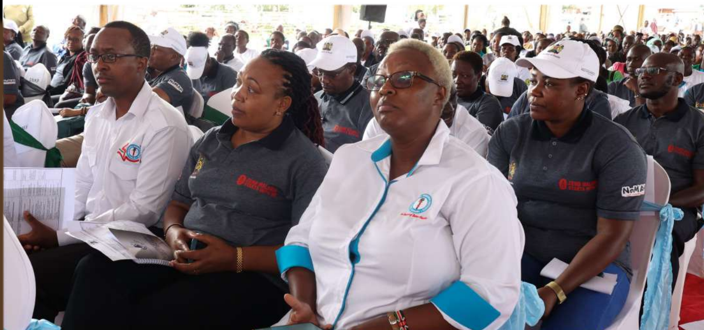
World Malaria Day event in Kenya, 25 April 2023

WACI Health collaborates with Malaria No More UK to host the Zero Malaria Campaign Coalition (ZMCC) Kenya, which provides a multi-stakeholder platform to elevate the importance of malaria prevention, treatment, and control on the national and sub-national agenda. The ZMCC achieved significant strides in 2023, strengthening communications on malaria, mobilizing resources, and amplifying community voices through a localized communications and branding campaign.