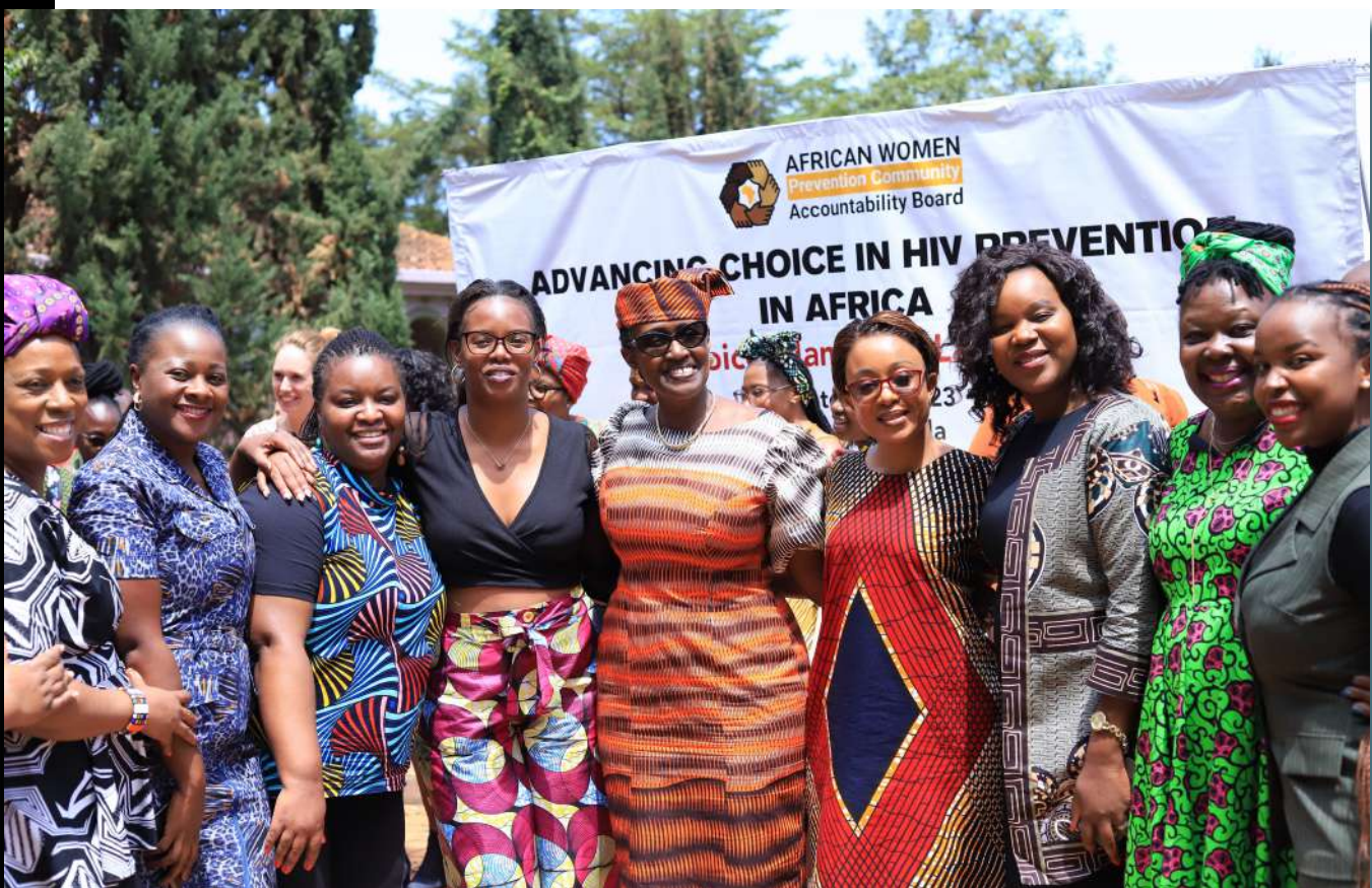
Choice Manifesto Launch, 8 September 2023

In 2023, the Africa Free of New HIV Infections (AfNHi) network, which includes WACI Health as a key member, made significant strides in HIV prevention research advocacy. A landmark achievement was the development and launch of the Choice Manifesto, in partnership with the African Women Prevention Community Accountability Board (AWPCAB) and other organizations. This manifesto, advocating for diverse HIV prevention options for African women and girls, received an endorsement from the Executive Director of UNAIDS. It represents a collective voice calling for sustained political and financial support for HIV prevention choices, bringing together stakeholders from various countries and securing commitments for its support and implementation. AfNHi serves as the communications lead within the AWPCAB and has been instrumental in amplifying the Manifesto's development and dissemination.