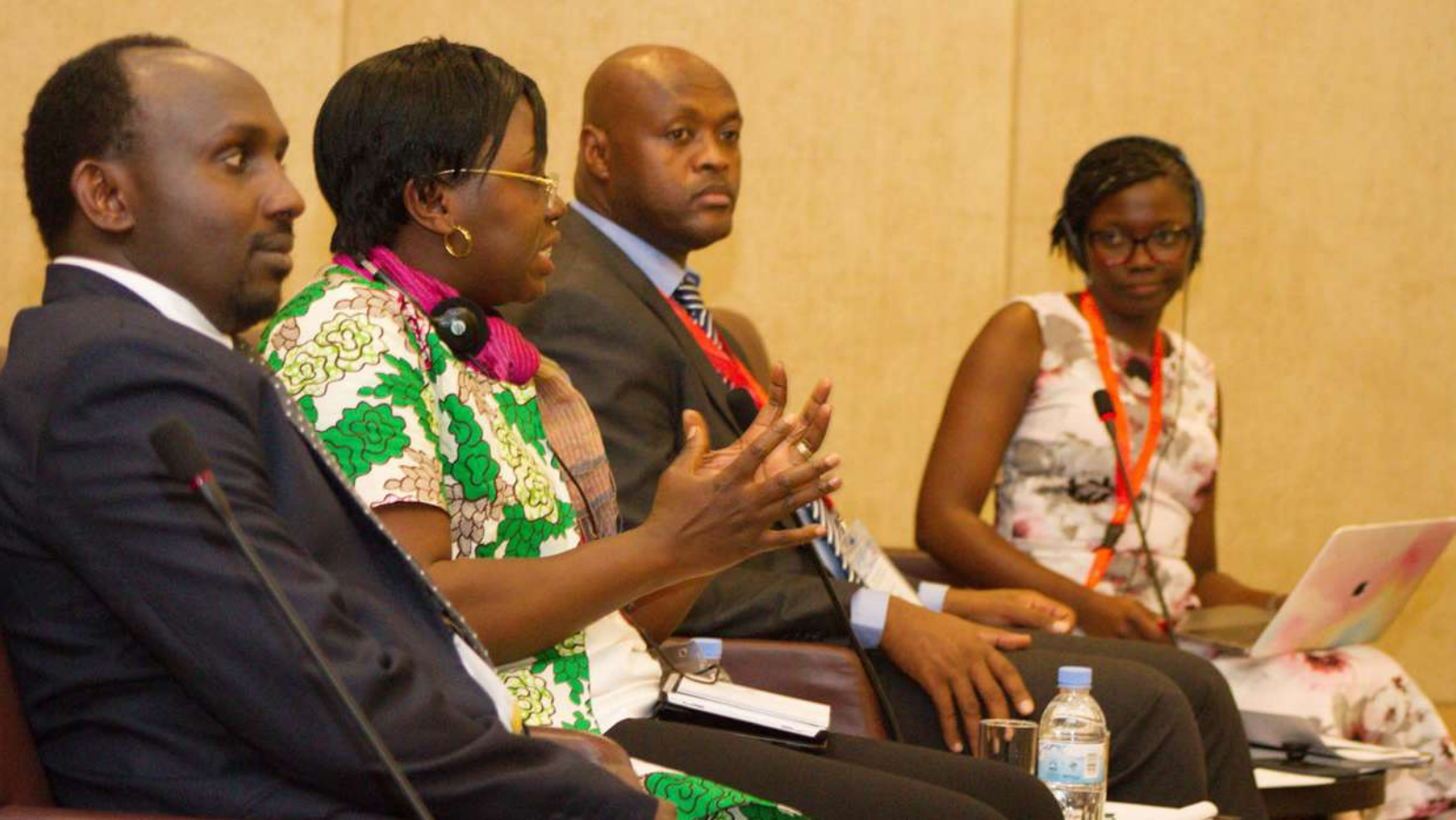
Civil society dialogue at the side lines of the Summit.