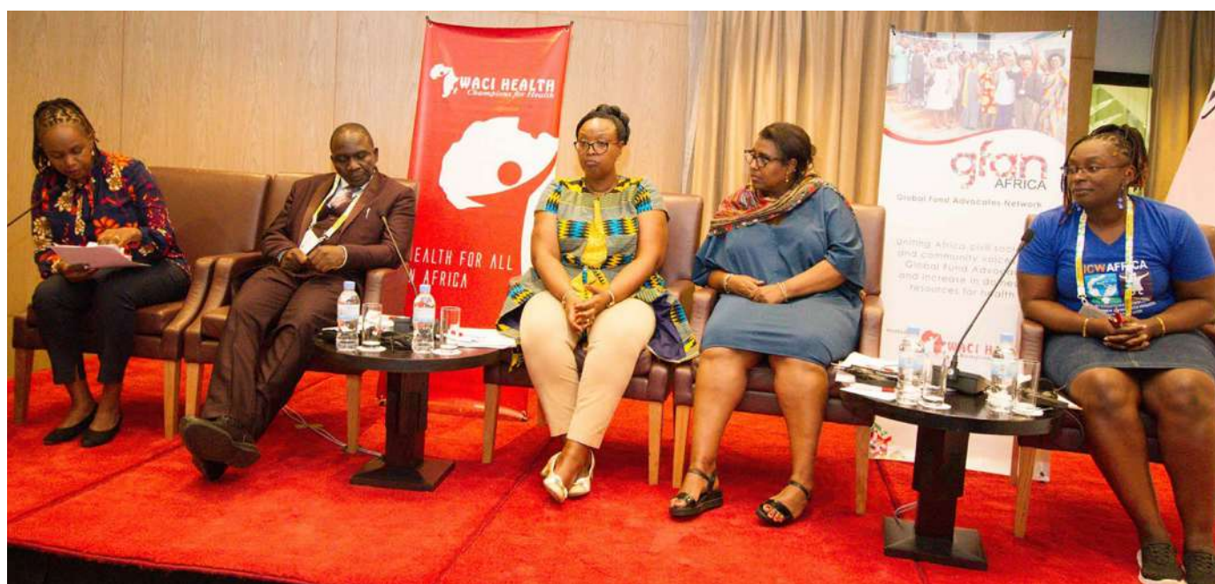
Civil society dialogue at the side lines of the Africa Leadership Meeting (ALM) on Investing in Health and the African Union Summit.

AfNHi in collaboration with GFAN Africa convened a civil society dialogue at the side lines of the African Leadership meeting (ALM) and the African Union Summit in Addis Ababa, Ethiopia in early 2019. Through this dialogue, an appreciation among civil society on the need to strengthen advocacy for domestic resources for health was felt. Following this dialogue a call to action was issued urging African Union member states to increased resources for health R&D.