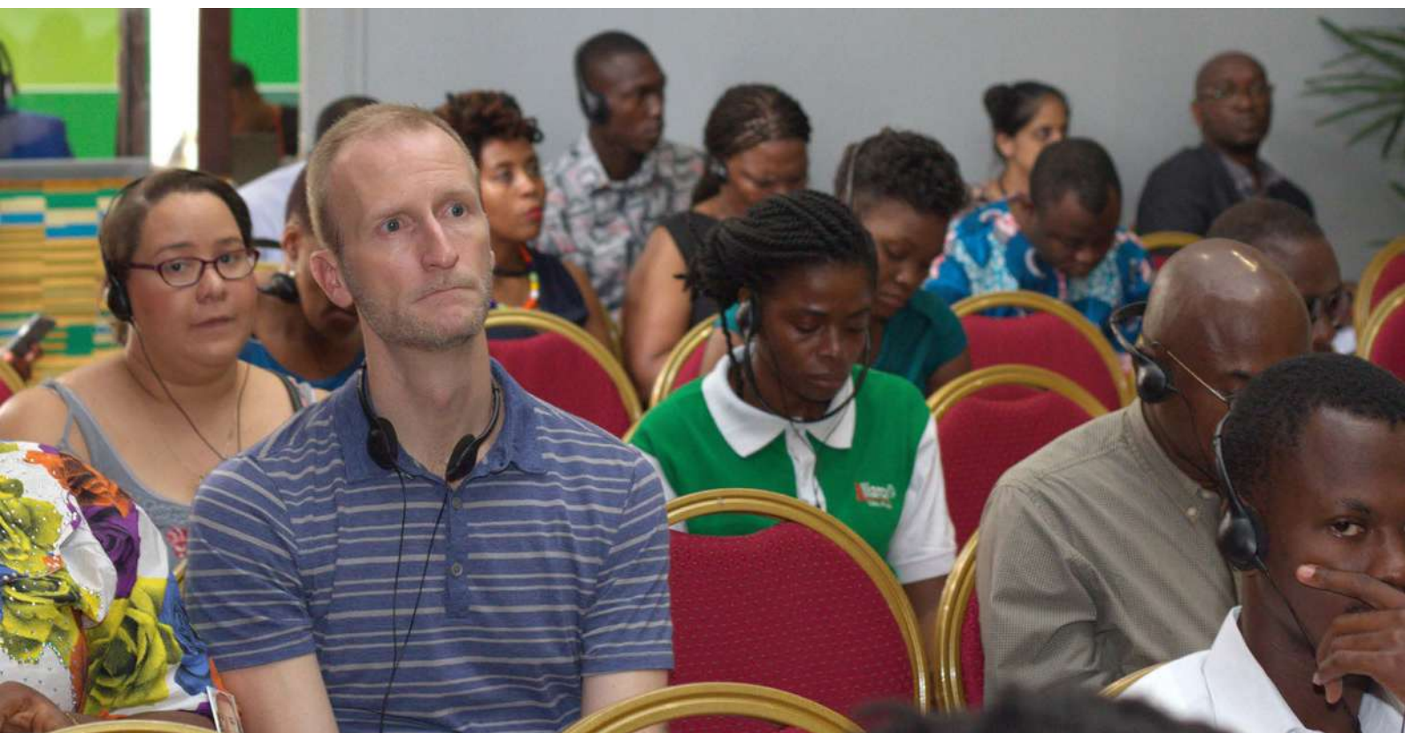
Biomedical HIV Prevention Forum (BHPF).

The Biomedical HIV Prevention Forum (BHPF) puts prevention research on the spotlight by providing a unique platform where participants gather to learn about progress in prevention science, best practices in biomedical HIV prevention research and understand the state of the field. The forum is a space for participants to share HIV prevention research perspectives and experiences. The biannual Forum is an official pre-conference of the International Conference on AIDS and STI's in Africa (ICASA). The 2019 BHPF in Kigali was the 4th, following successful forums in 2013, 2015, and 2017.